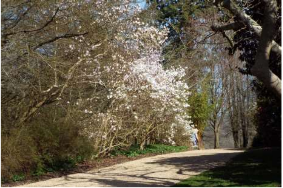
A spring day at Nyman's.